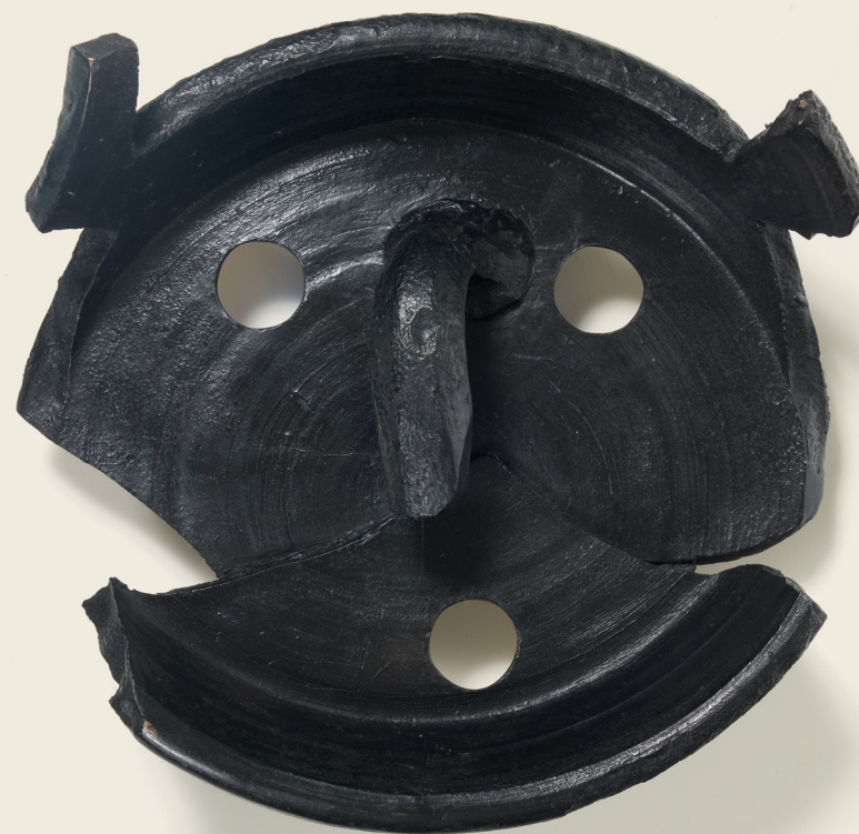
Mask Eric Schmitt. Black patinated bronze. Other patinas: green, brown, polished gold, yellow or white gold leaf.