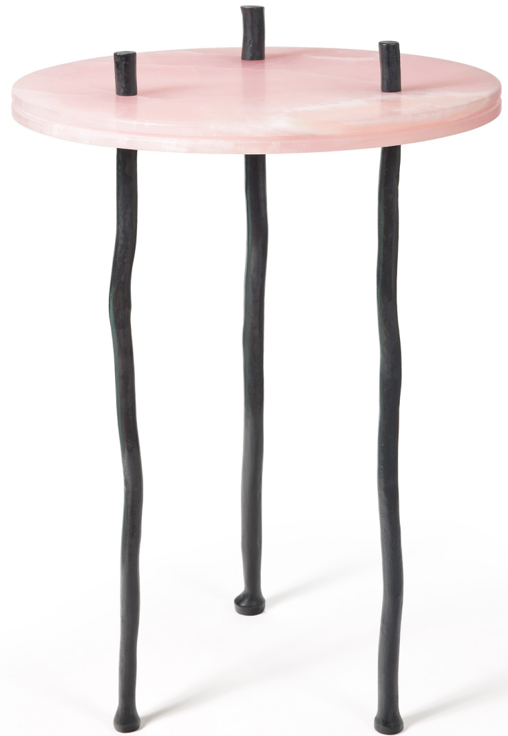
Onyx Pedestal Table Eric Schmitt. Bronze and pink onyx. Double onyx top version, unique piece. Single top version, 12 numbered copies.