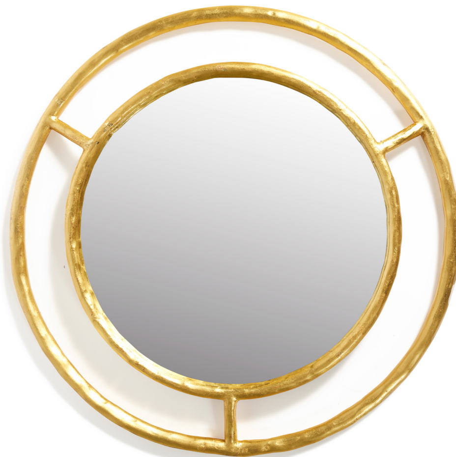
Avanti Round Mirror Mattia Bonetti. Hand-wrought iron, yellow gold leaf. Other finishes: green, black, gold, white gold leaf. Limited edition of 30 numbered copies. Diameter 63 cms. Other dimensions on request.