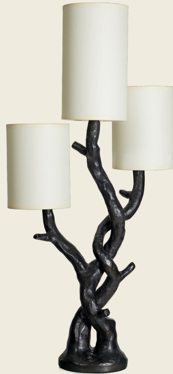
Washington Square Lamp Mattia Bonetti. Black patinated bronze. Other patinas: green, brown, gold. Limited edition of 100 numbered copies (per patina).