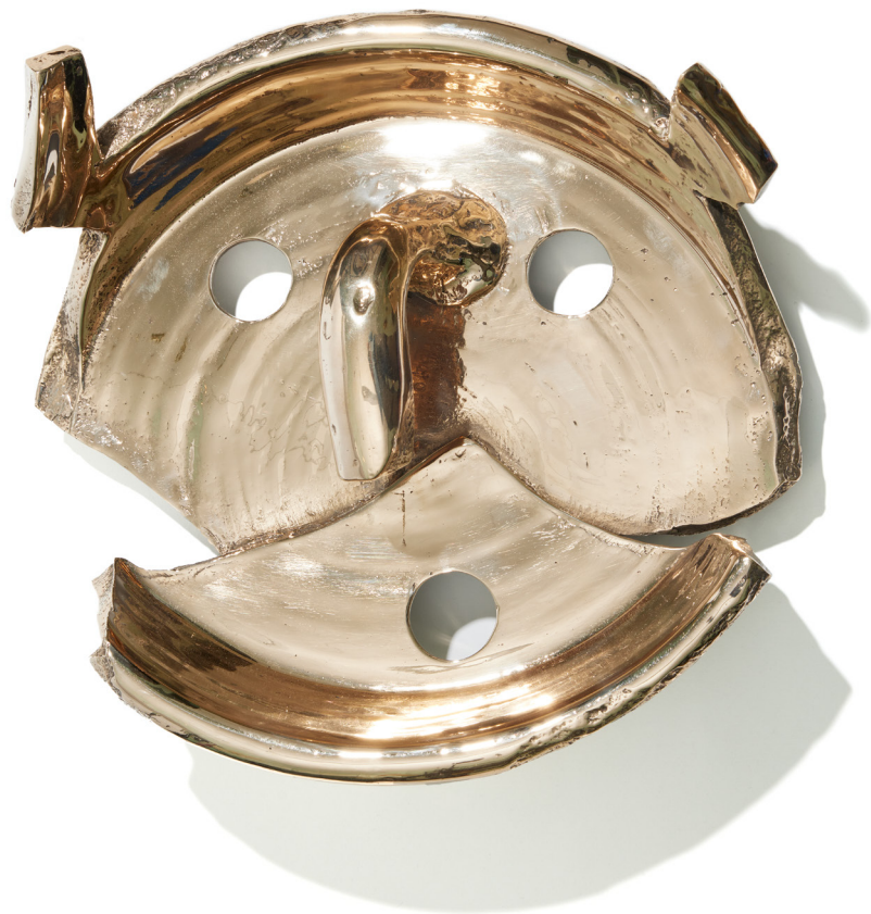
Mask Eric Schmitt. Gold polished bronze. Other patinas: green, black, brown, yellow or white gold leaf.