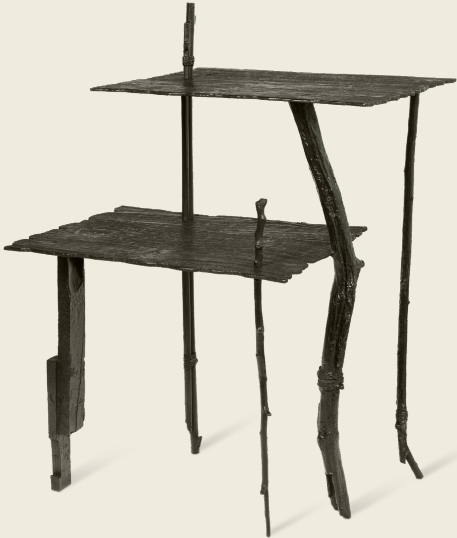
Boy Scout Pedestal Table Mattia Bonetti. Black patinated bronze. Other patinas: green, brown, gold. Limited edition of 30 numbered copies (per patina).