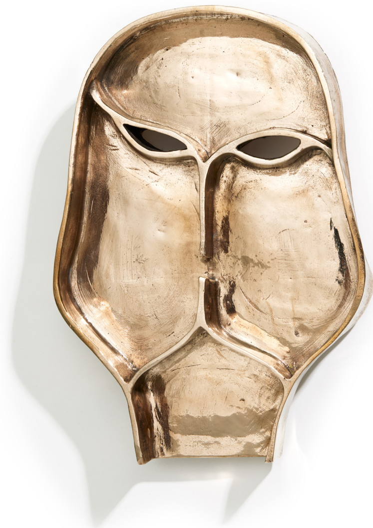
Belphegor wall light Eric Jourdan. Gold polished bronze. Other patinas: green, black, brown, yellow or white gold leaf.