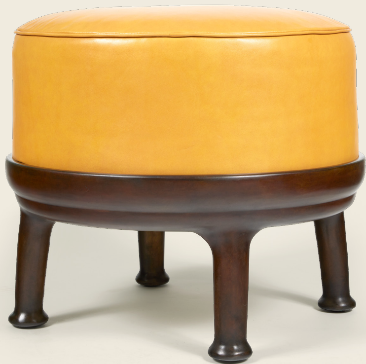
Small Stool Salammbô Eric Schmitt. Brown bronze and leather. Other patinas: green, black, gold. Limited edition of 12 numbered copies (per patina).